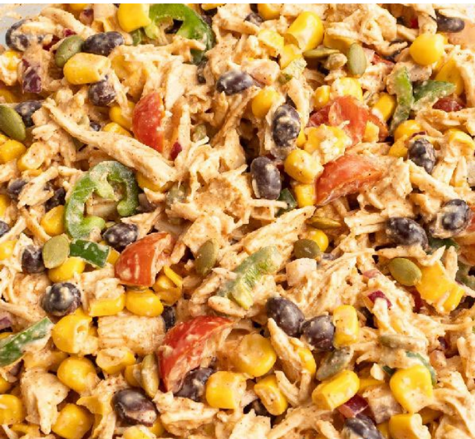
Southwest Chicken Salad $9.50/Person