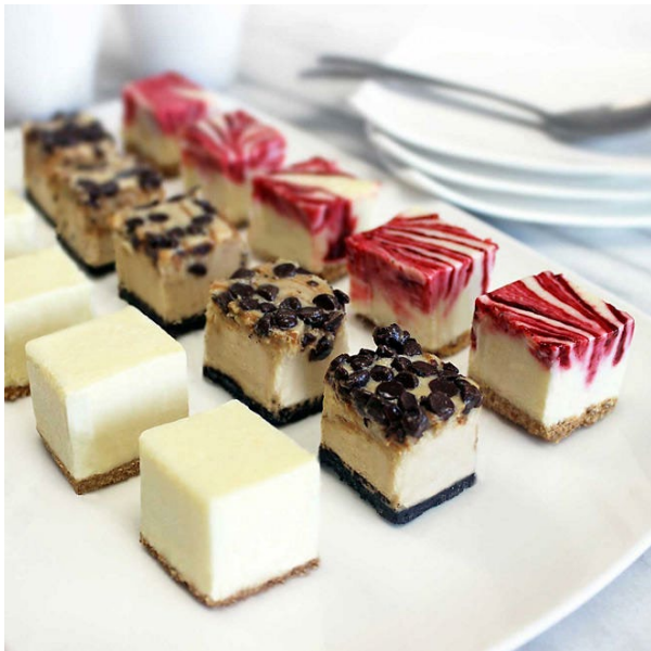
Assorted Cheesecake Bites $2.00/Person