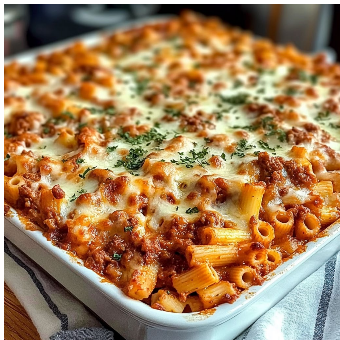
Baked Ziti - $9.50/Person