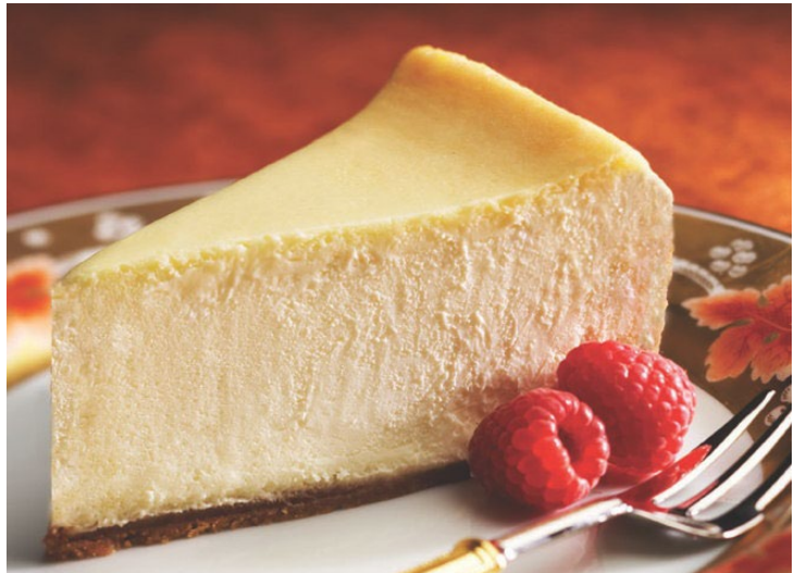
New York Style Cheesecake