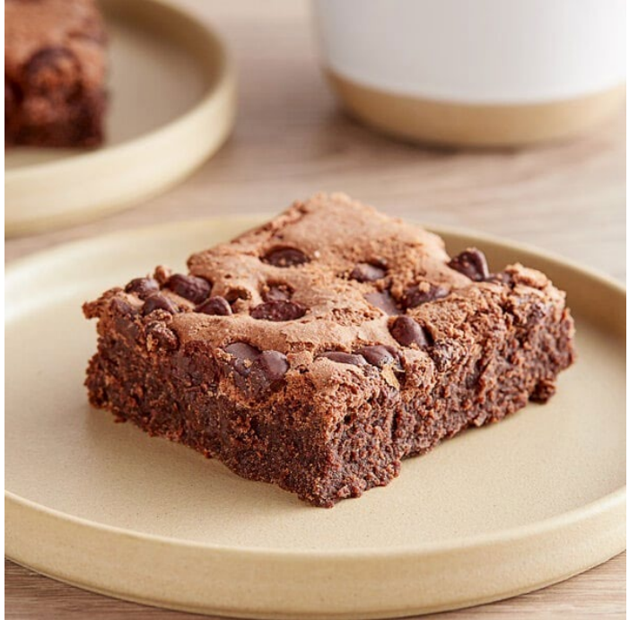
Brownies (Rocky Road or Chocolate Chip) - $1.50/Person