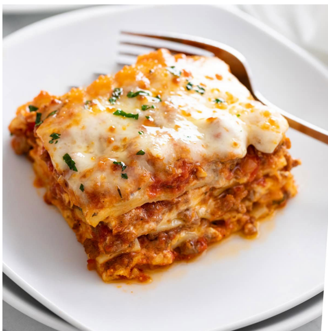
Lasagna – $9.50/Person Choose Meat or Vegetarian

Above Include Breadsticks. Add a Caesar or Mixed Salad to Any Above for Add'l $1.50/Person