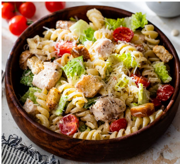
Chicken Caesar Pasta Salad $9.50/Person