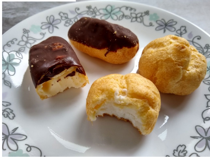
Mini Eclairs & Cream Puffs $1.50/Person