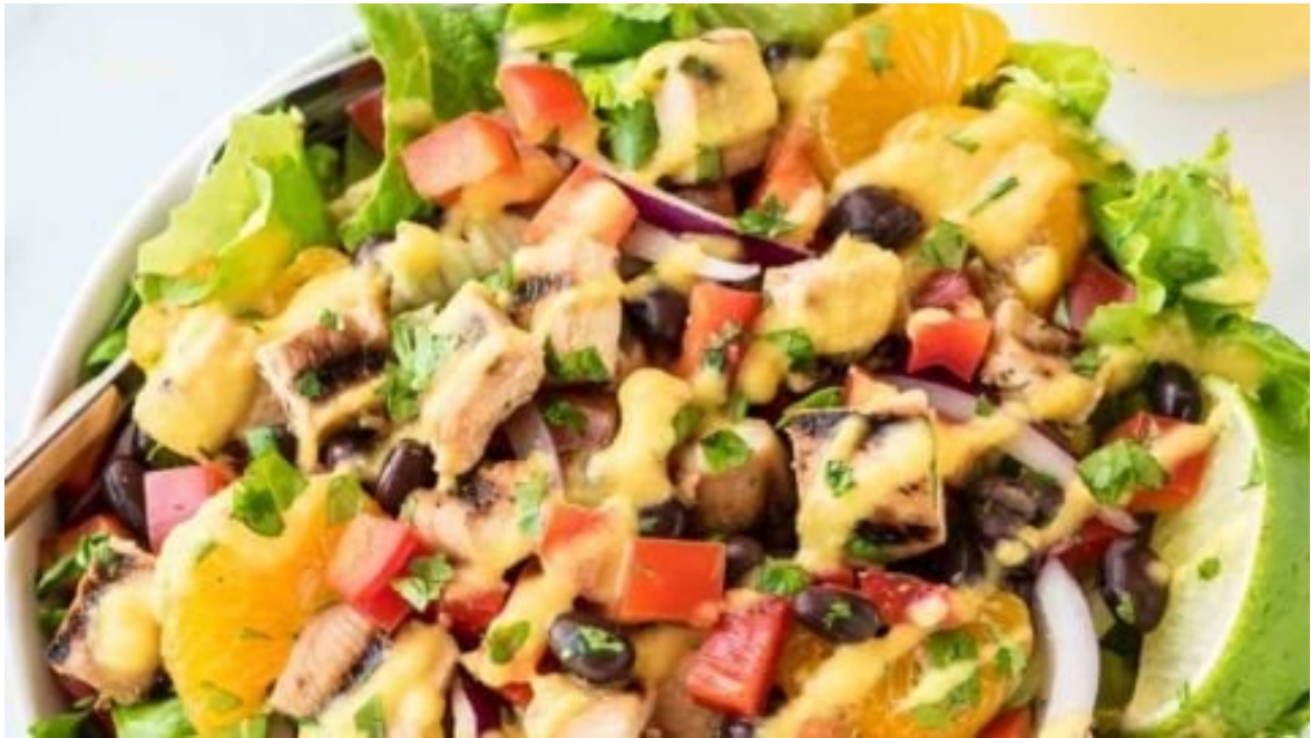
Jamaican Jerk Chicken Salad - $9.50/Person