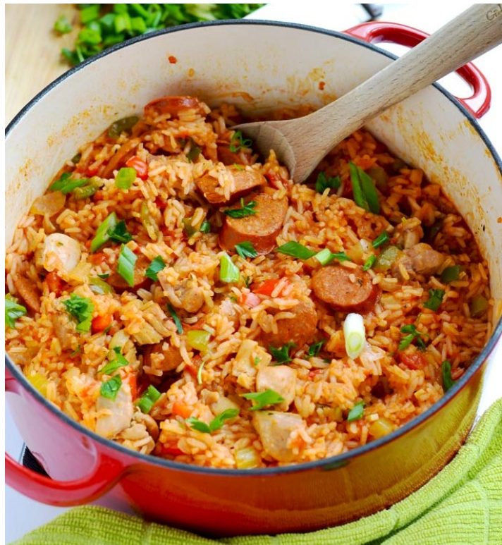
Jambalaya - $12.50/Person