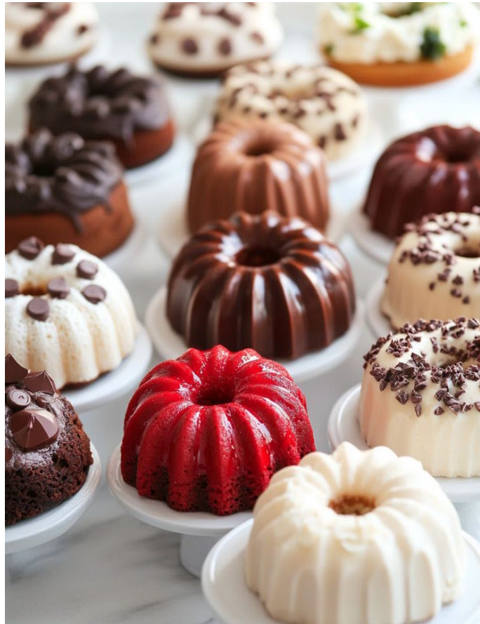
Mini Bundt Cakes - $3.00/Person (Lots of Flavors/Varieties)