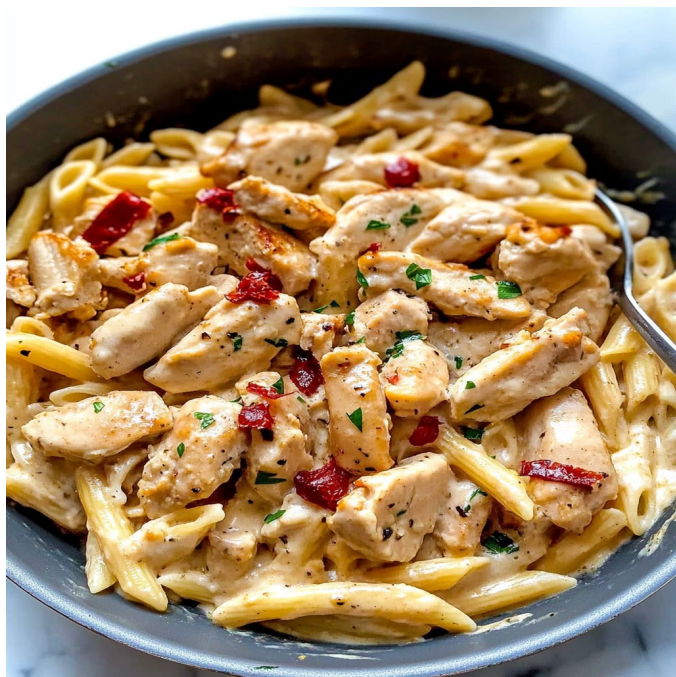
Marry Me Chicken Pasta $9.50/Person