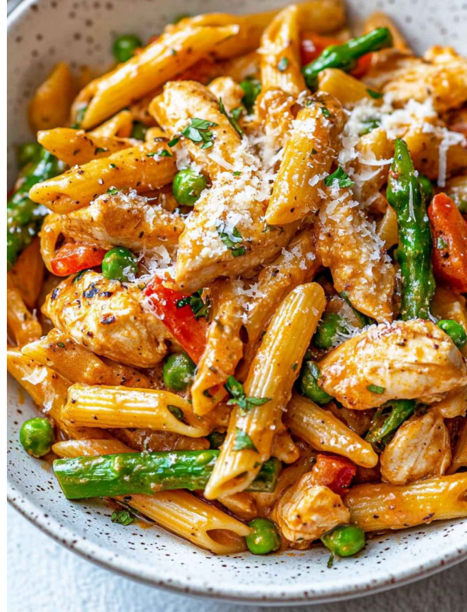
Spicy Chicken Chipotle Pasta $9.50/Person