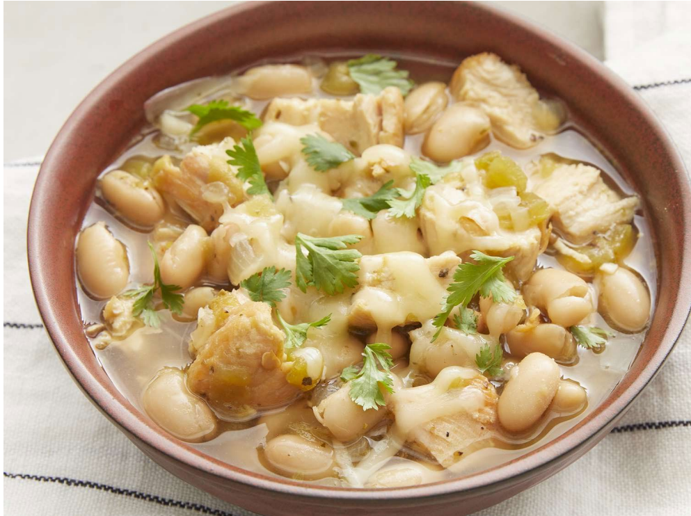
White Chicken Chili - $10.50/Person