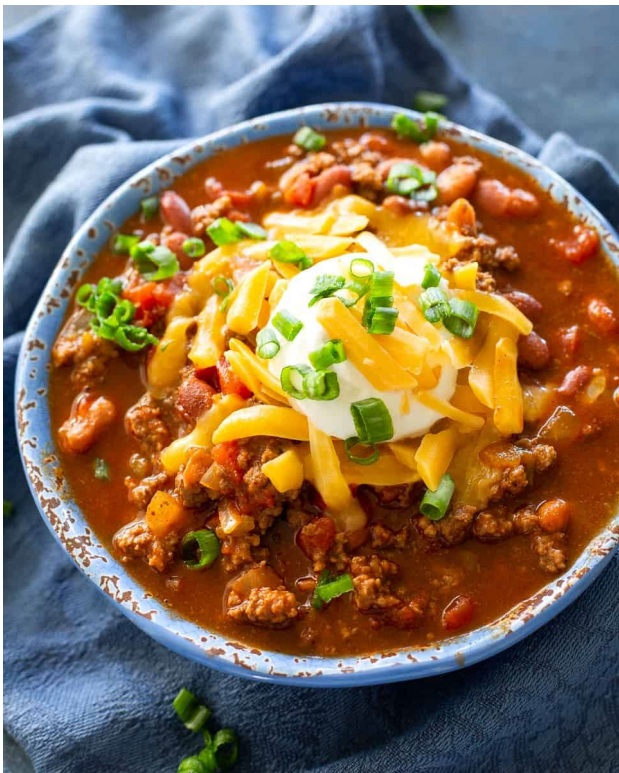
Beef Chili - $11.50/Person