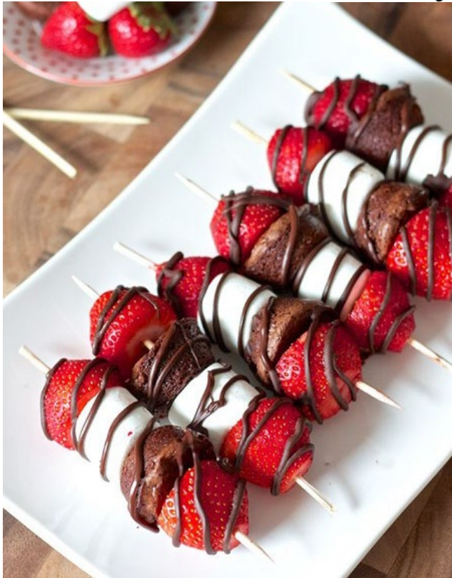
Strawberry Brownie Kabobs $2.50/Person