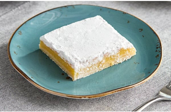
Lemon Bars - $1.50/Person